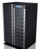
100-120 kVA + Battery Cabinet