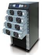
Scalable and Hot-swappable